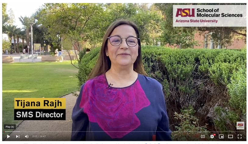
Full 2022 Awards Video | 2022 SMS Awards Website